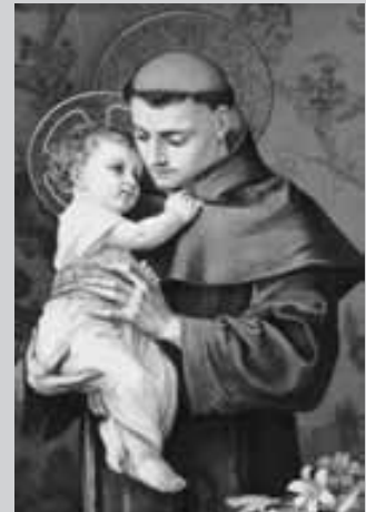
St. Anthony of Padua

Masses: Saturday 5:00 p.m. Sunday 8:30 a.m.